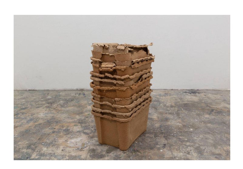
Prime Objects II, 2021, Amazon shipping boxes, cast bronze, sand, pigment, PVA.