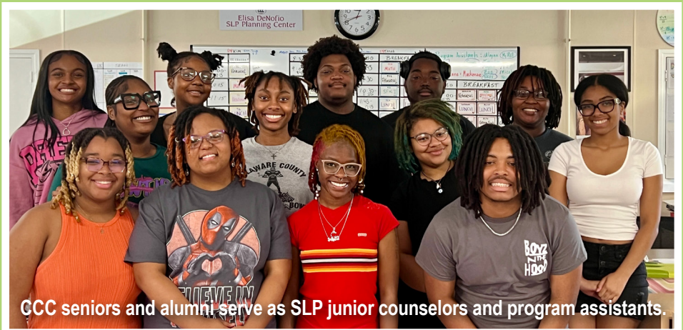
GCC seniors and alumni serve as SLP junior counselors and program assistants.